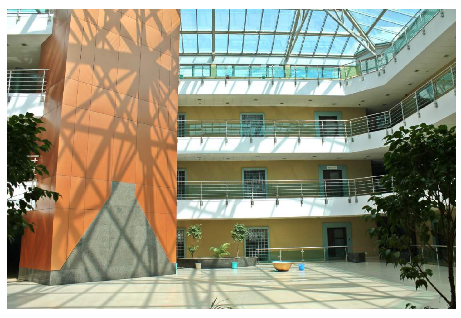
© Copyright 2007 First European Infotech India Ltd (A condor Polymeric property)