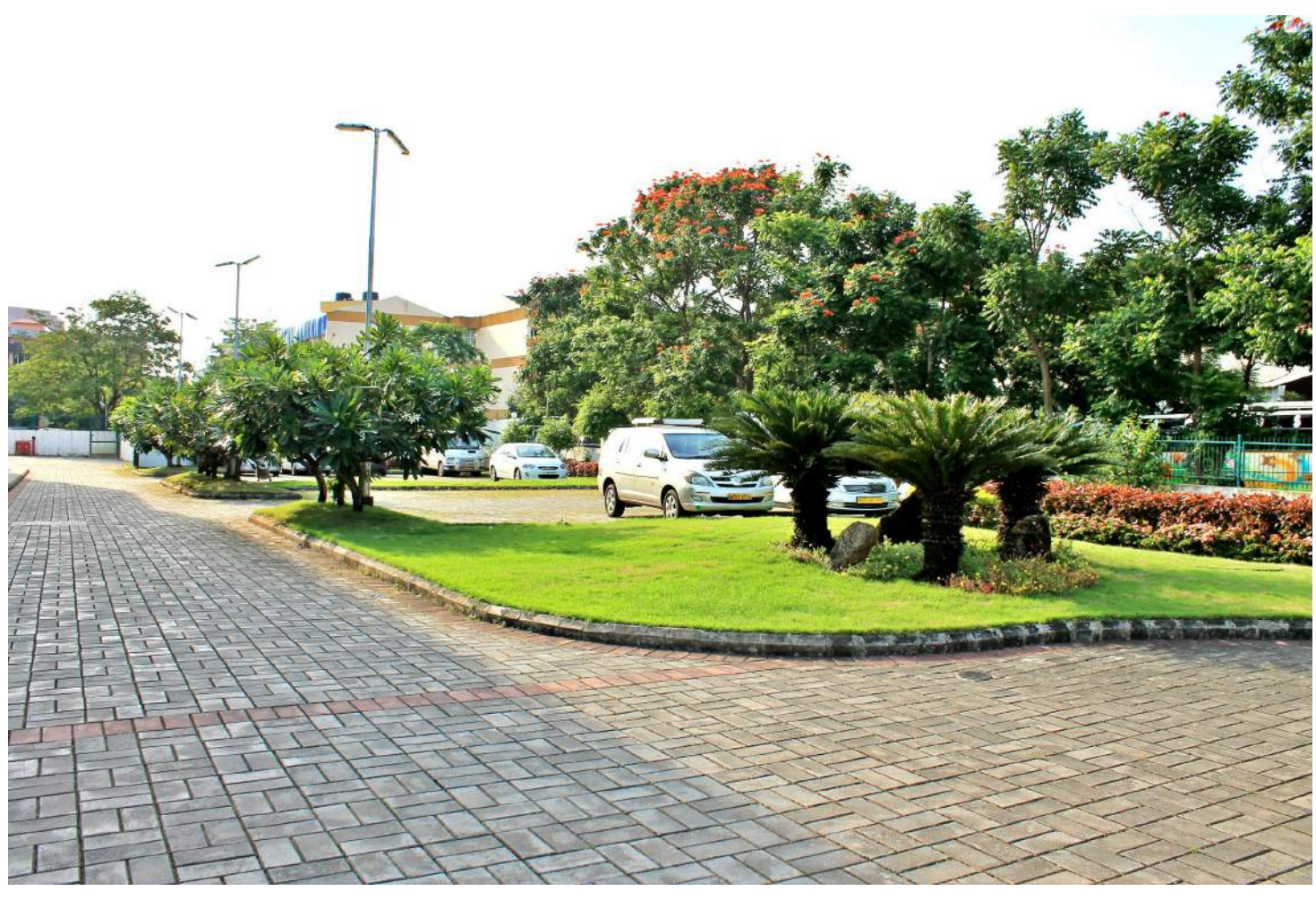
© Copyright 2007 First European Infotech India Ltd (A condor Polymeric property)